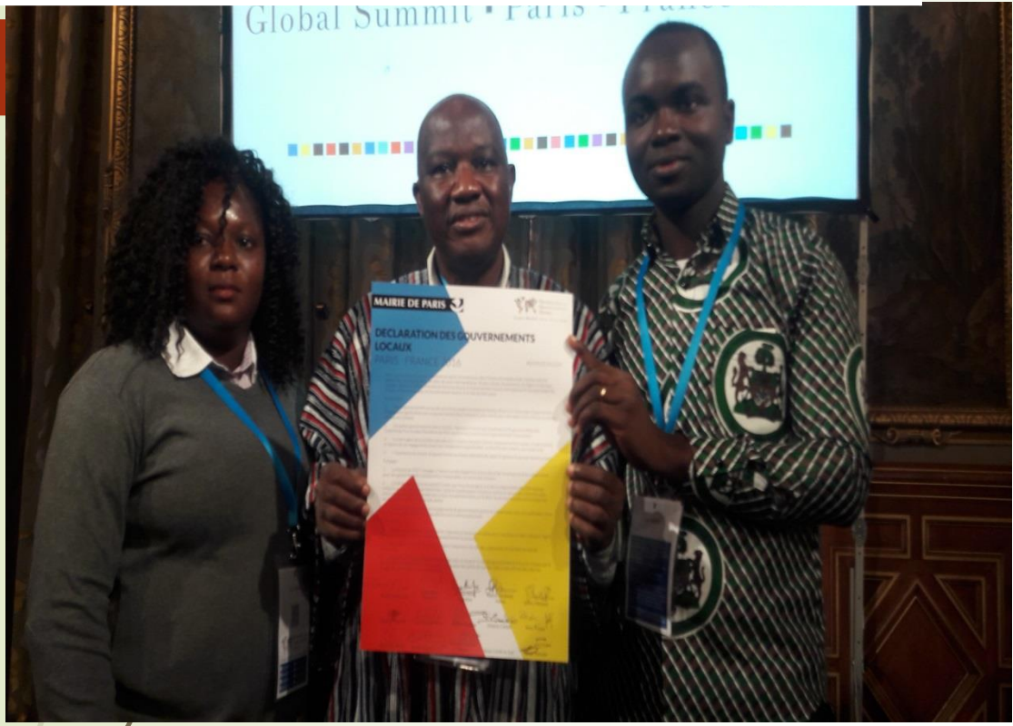
STMA at the Global stage in Paris –December 2016